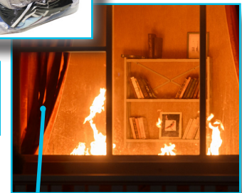
Textiles after a house fire