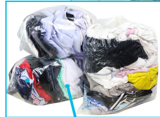
Clothing trapped in plastic bags